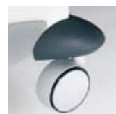
Castor with brake

Zimmer MedizinSystems Corp. 25 Mauchly, Suite 300 Irvine, CA 92618 Phone (800) 327-35 76 Fax (949) 727-21 54 info@zimmerusa.com www.zimmerusa.com